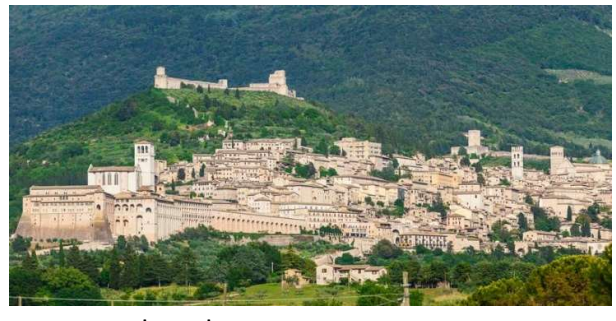
Assisi 25th- 27th May 2023 2 nights Half Board