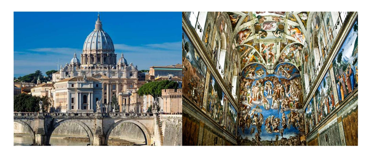
Assisi Walking Tour including St Francis Basilica Rome 27<sup>th</sup> May -31<sup>st</sup> May 2023 4 nights B&B

Visiting the Vatican Museums & Sistine Chapel Irish college for Mass on Sunday Catacombs of Rome & Ancient Appian Way